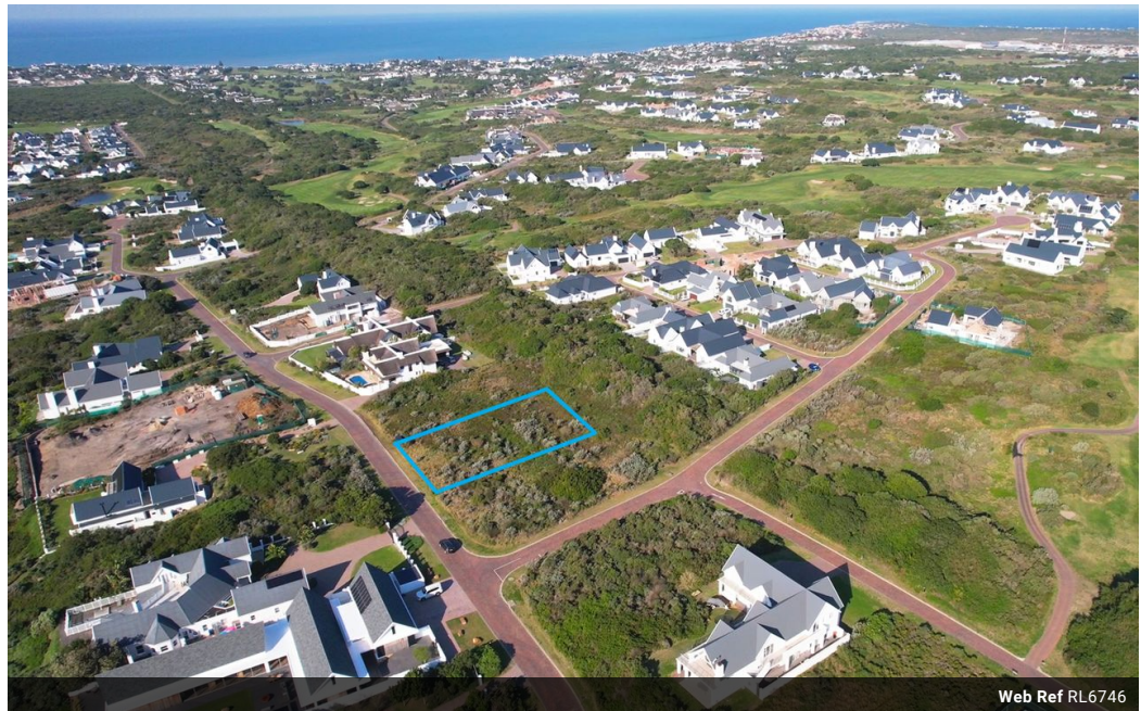
Web Ref RL6746

12 Lyme Road South Village Shopping Centre St Francis Bay 6312