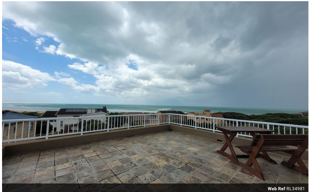
Web Ref RL34981