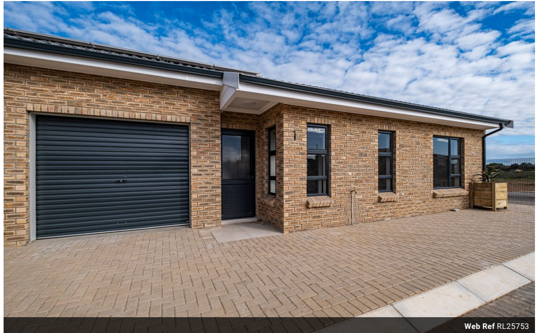
Web Ref RL25753