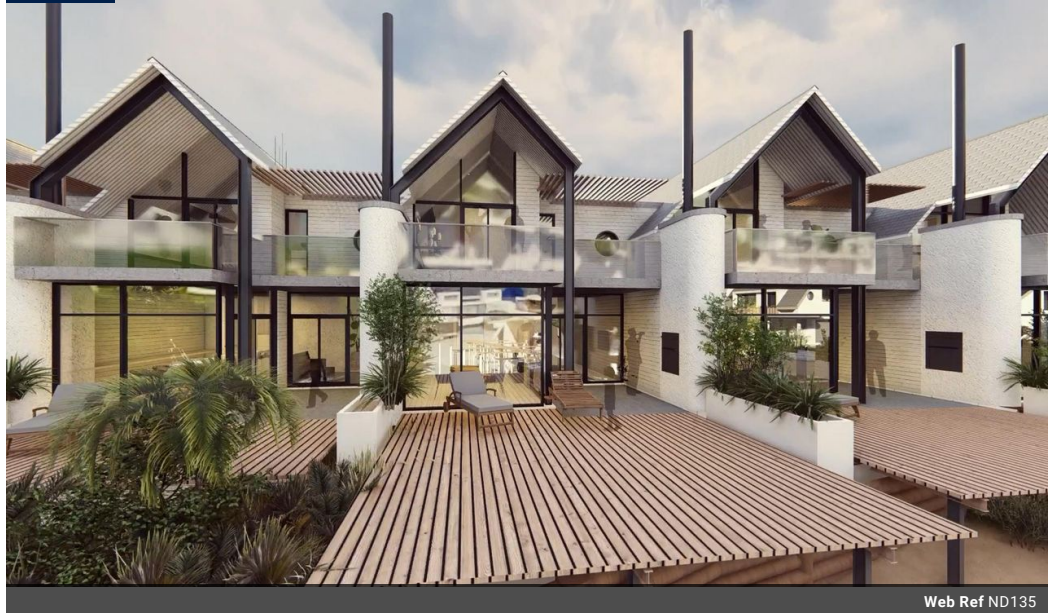
Web Ref ND135