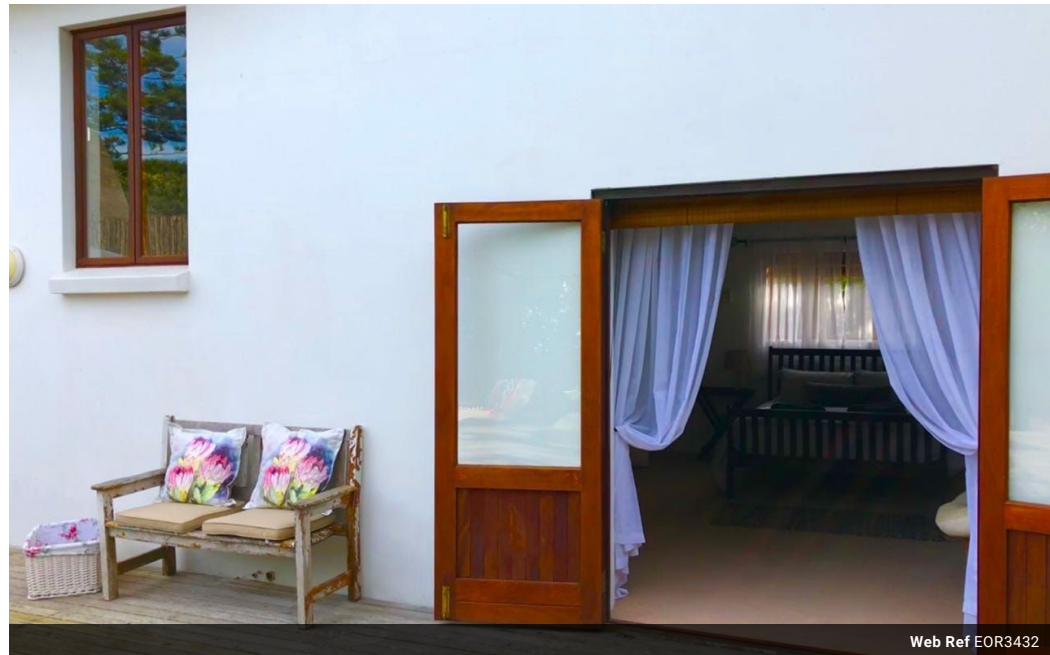
Web Ref EOR3432