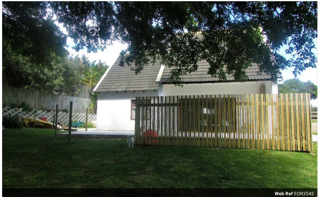
Web Ref EOR3542