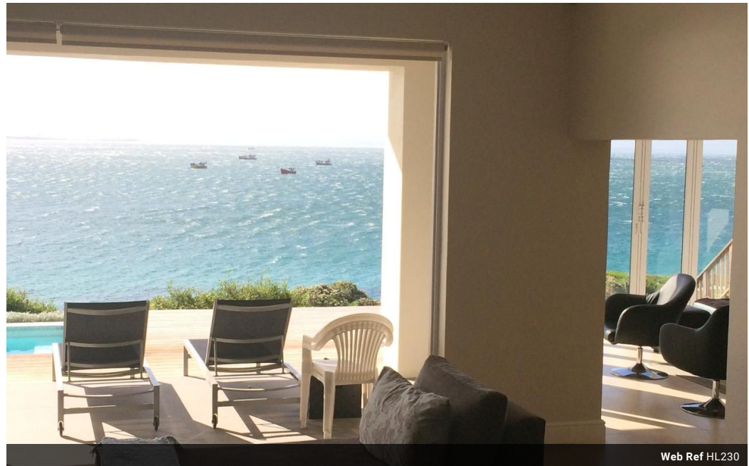
Web Ref HL230