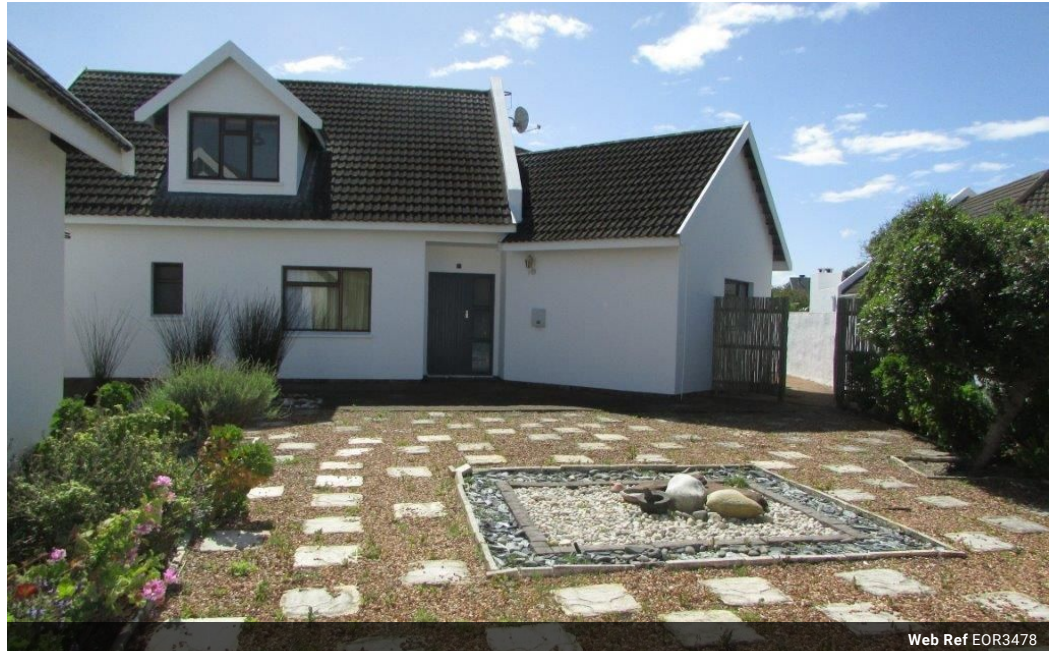
Web Ref EOR3478