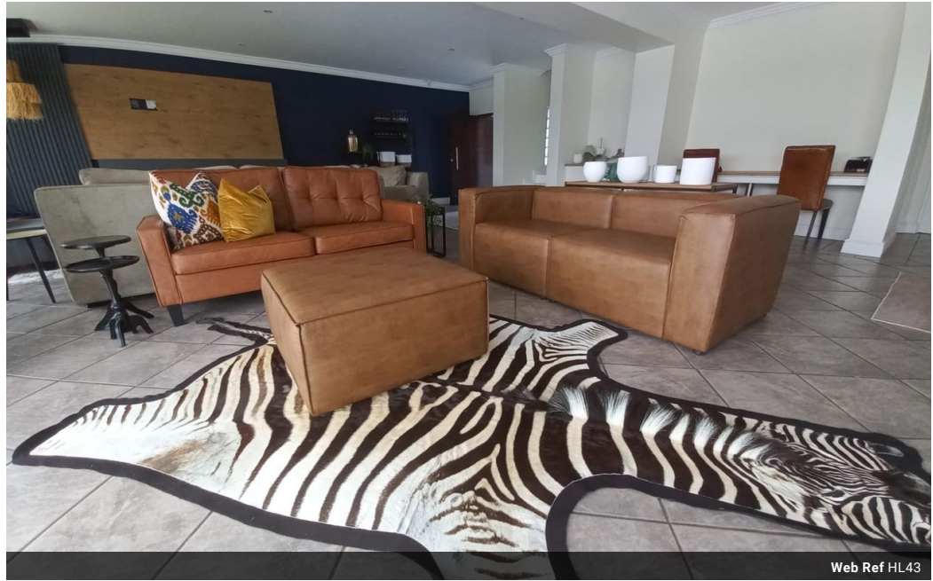
Web Ref HL43