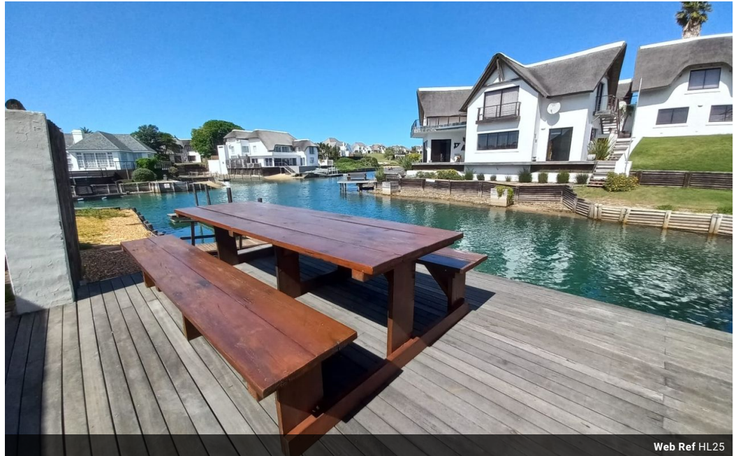
Web Ref HL25