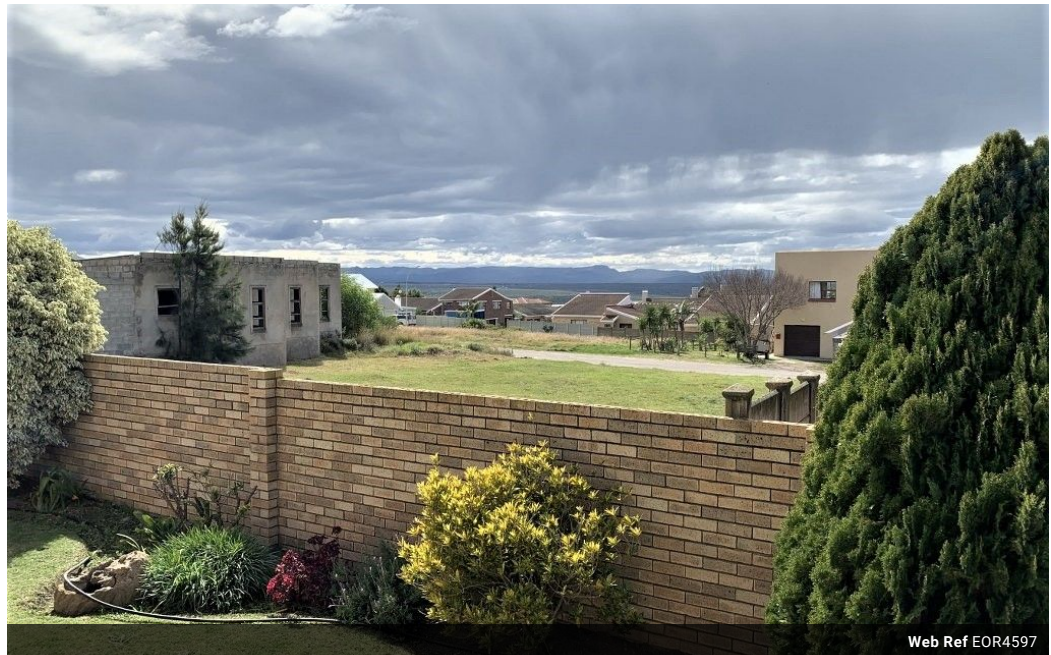
Web Ref EOR4597