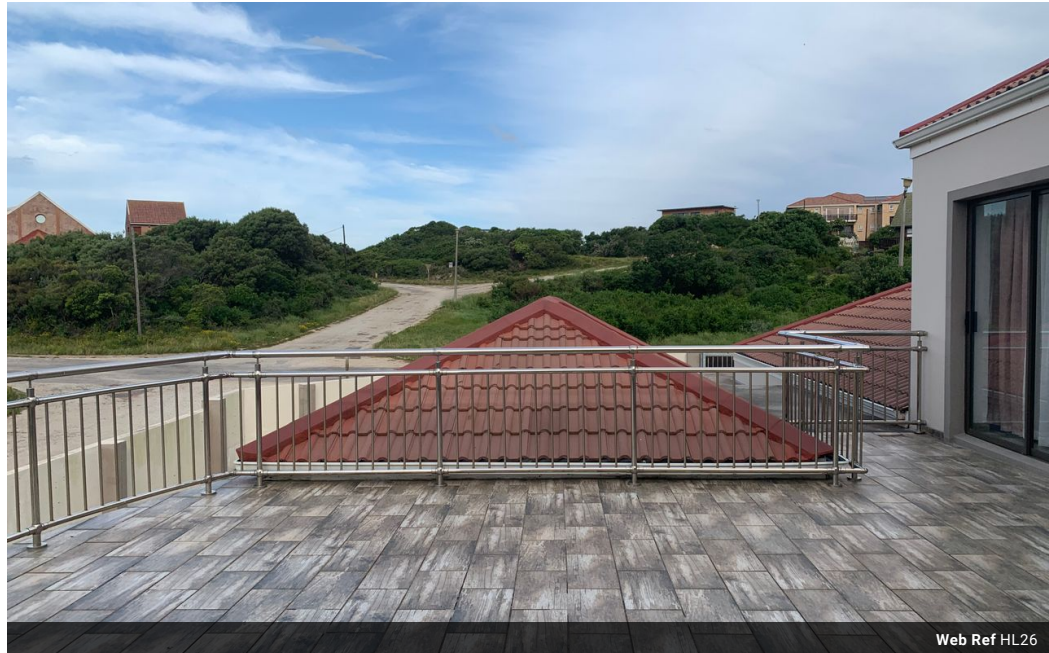
Web Ref HL26