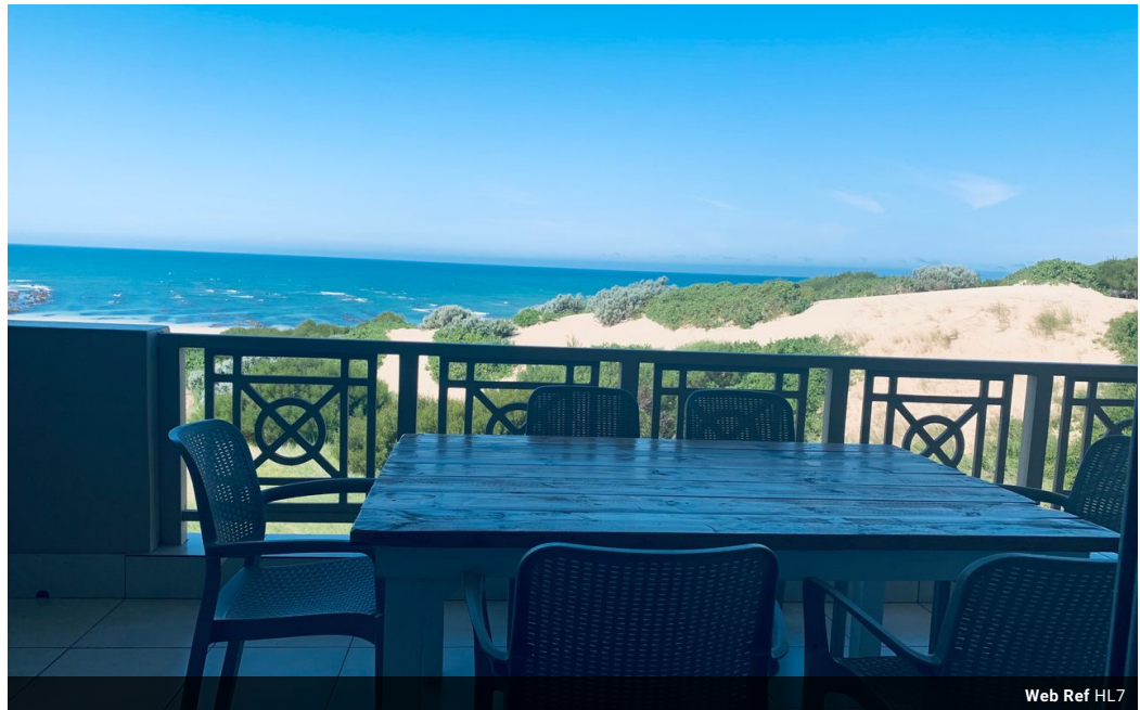
Web Ref HL7